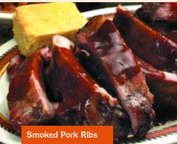
Smoked Pork Ribs