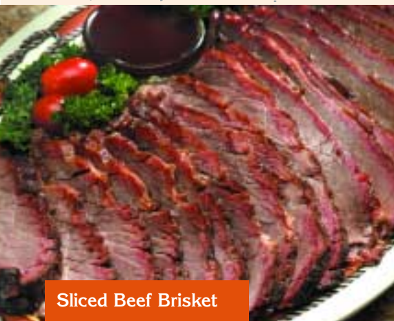
Sliced Beef Brisket