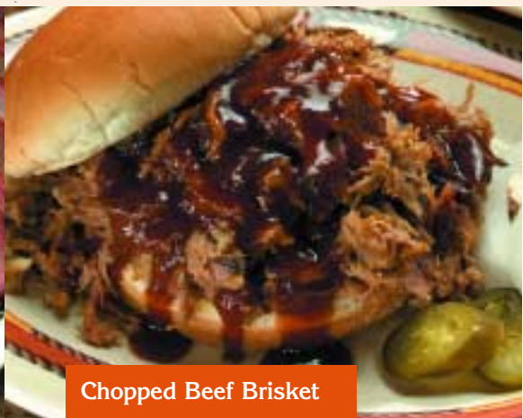
Chopped Beef Brisket

A Hickory River favorite. Slices of tender, choice beef brisket, hand-coated with our awesome rub and hickory-smoked to perfect tenderness.