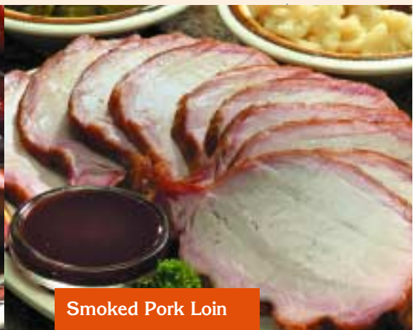
Smoked Pork Loin

Meat so moist and tender it falls away from the bone. Smoked over a hickory fire and slathered with our celebrated barbecue sauce.