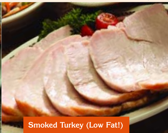
Smoked Turkey (Low Fat!)

A half chicken, smoked slow to seal in all the juices and flavor, served with our Texas-style barbecue sauce.